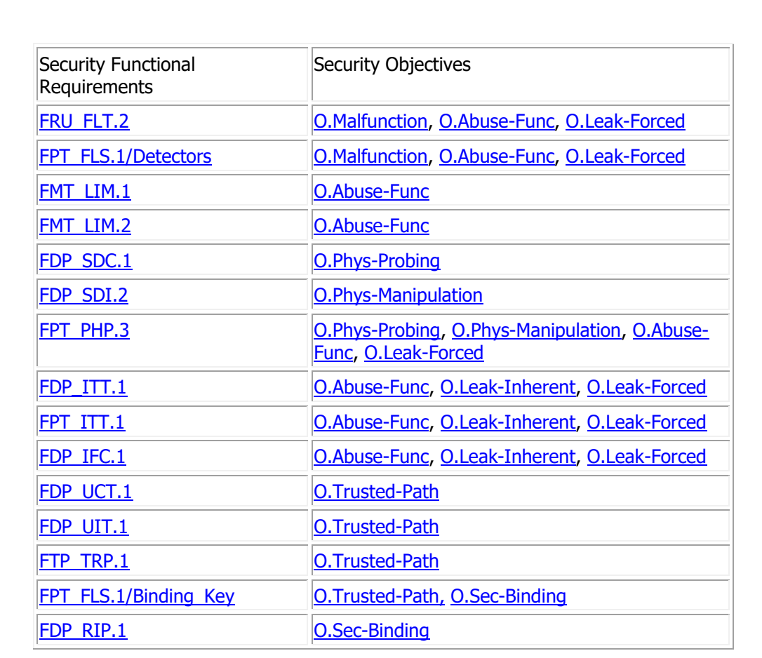
Table 12 SFRs and Security Objectives